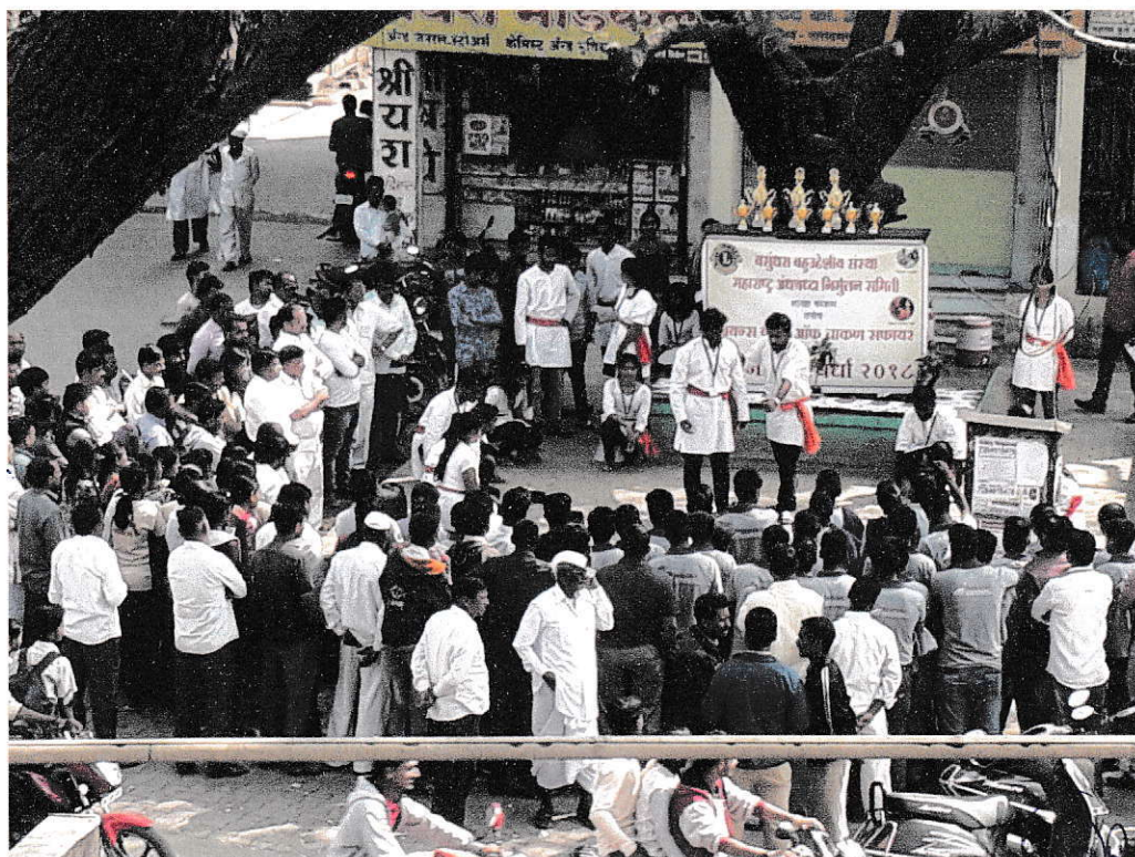
PRINCIPAL NSCT'S College of Education Chakan, Tal-Khed, Dist-Pune