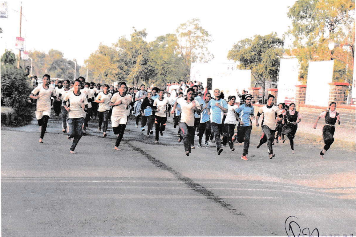
PRINCIPAL NSCT'S College of Education Chakan, Tal-Khed, Dist-Pune