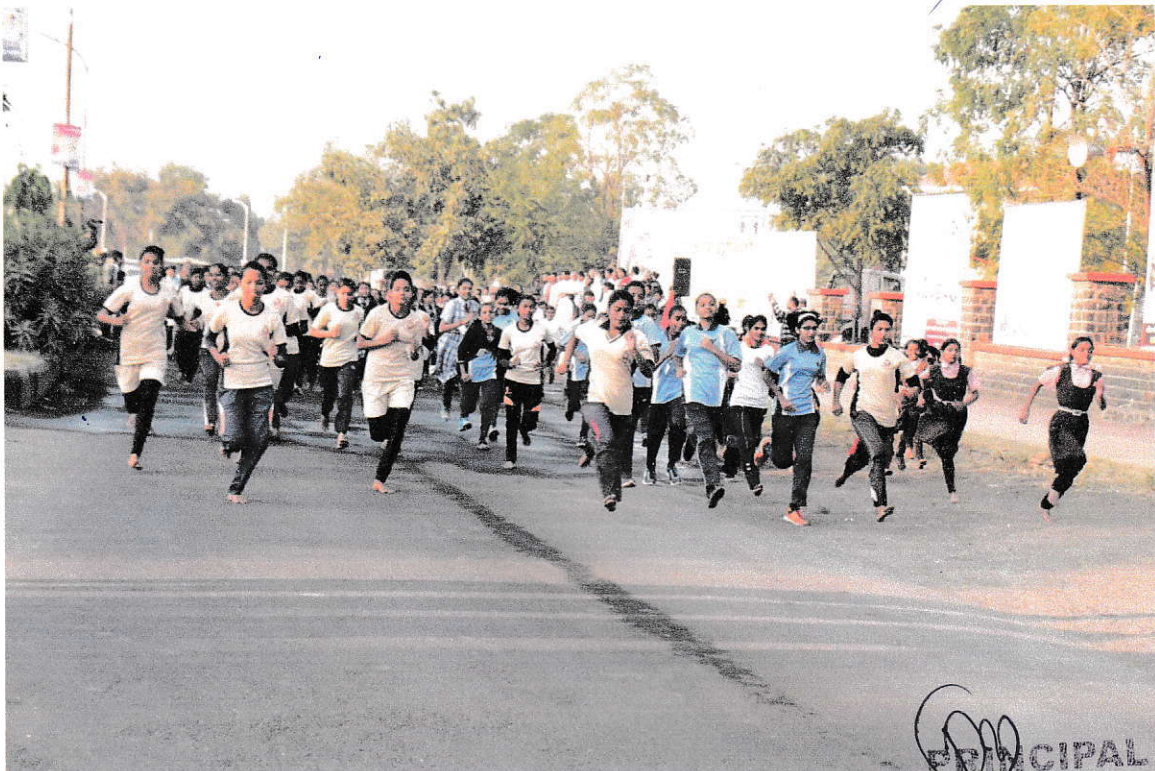
PRINCIPAL NSCT'S College of Education Chakan, Tal-Khed, Dist-Pune