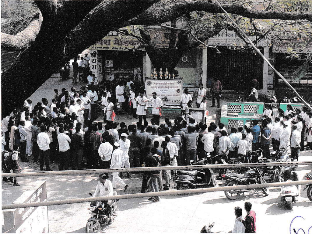
PRINCIPAL NSCT'S College of Education Chakan, Tal-Khed, Dist-Pune